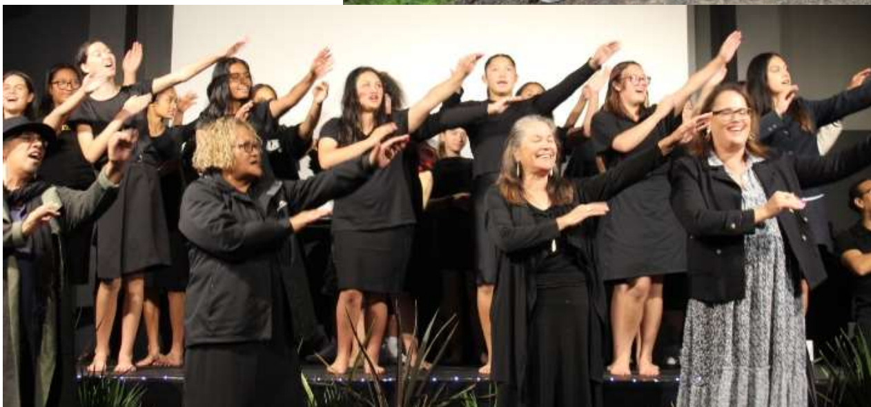
Waiata at Te Puaawaitanga 20th Reunion