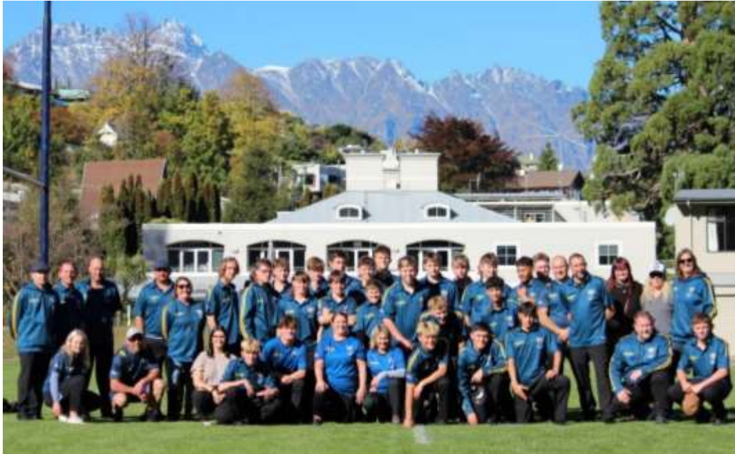
The full South Island rugby tour group