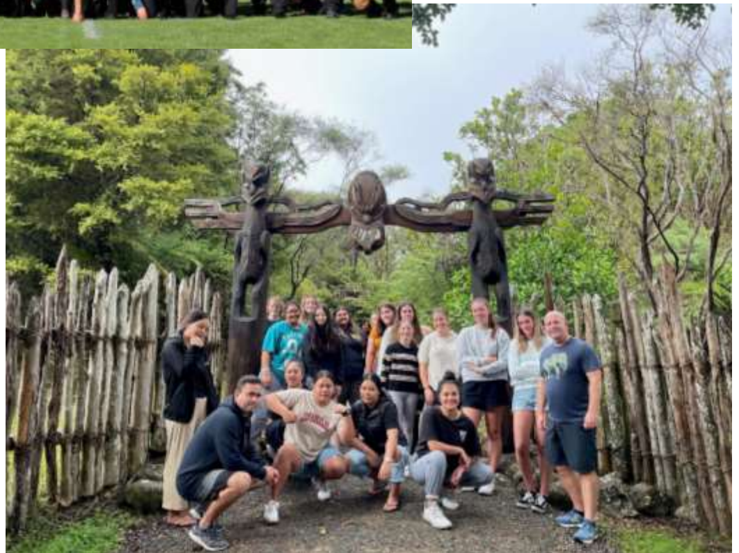
Year 13 History and Te Ao Maori classes at Ruapekapeka